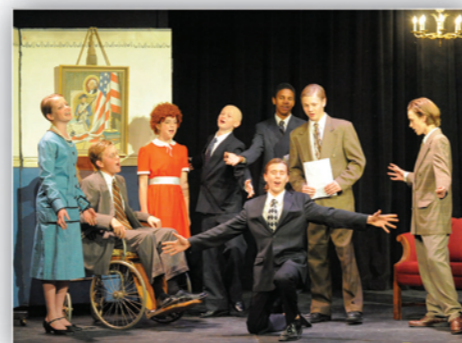
B. Sheila C. Johnson Performing Arts Center