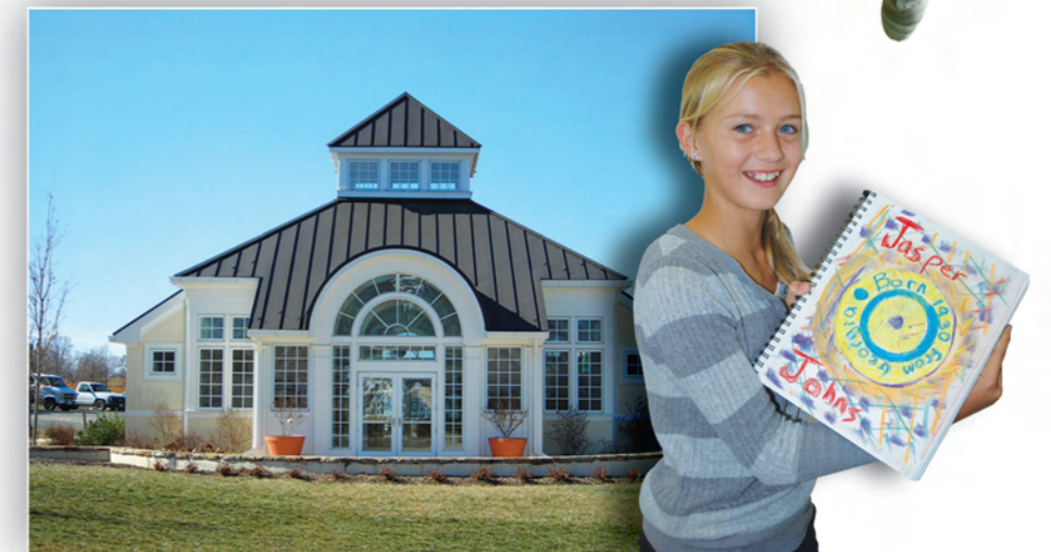
E. Art Building