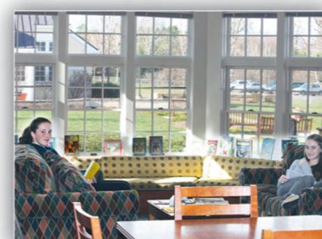
C. Arundel Family Library