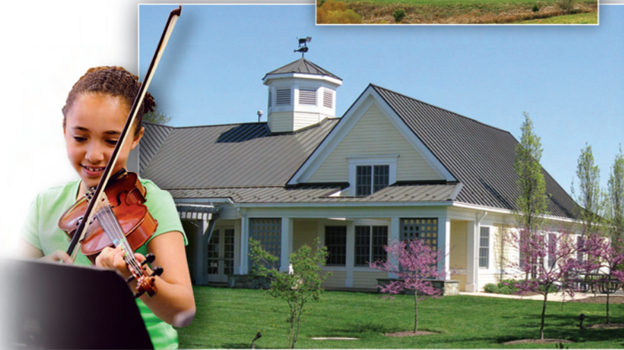
G. Peard Music & Lunch Building