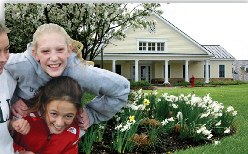
A. Main Office & Classroom Building