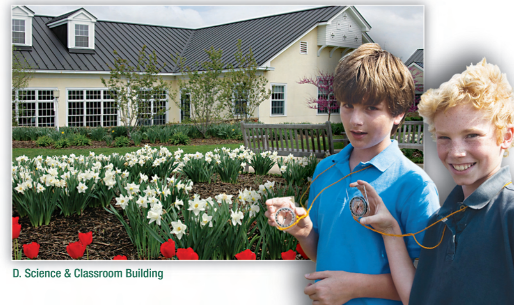
D. Science & Classroom Building