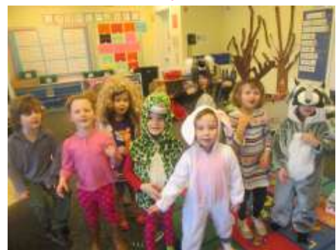
Dress Rehearsal for our play!