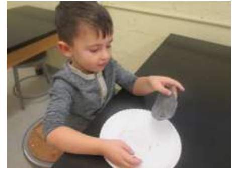
Making Animals Footprints on Clay in Science!