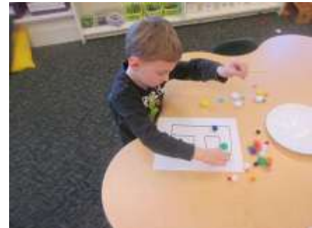
Pom-Poms for P week!